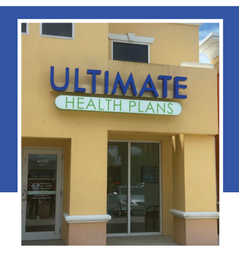
4058 Tampa Rd, STE 7 Oldsmar, FL 34677