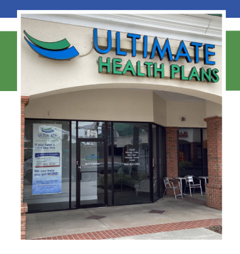
303 SE 17th St, STE 305 Ocala, FL 34471